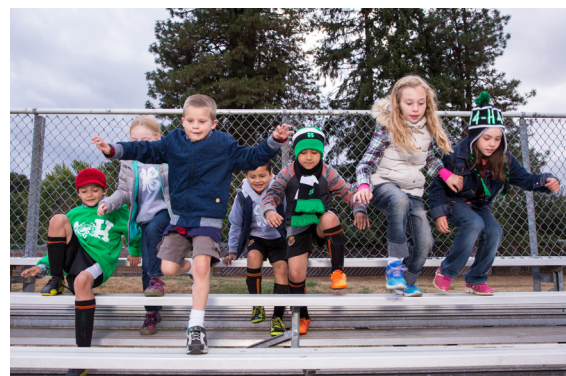
The youngest 4-H'ers: Coverbuds, ages 5 to 7.

In addition to community 4-H clubs, youth may opt to participate in 4-H special interest groups/project clubs that focus on one specific topic, school enrichment activities, or after-school programs.