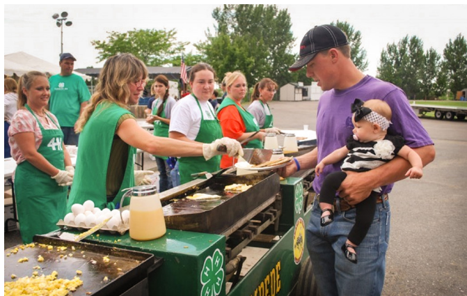
Canyon County 4-H volunteers serving pancakes at the Buckaroo Breakfast 4-H fundraiser.