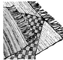
Exhibit your finished rug.

Make a hooked rug according to your purpose and size desired.