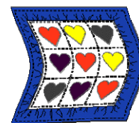
Exhibit your finished quilted item.

*Finishing Techniques for quilt, wall hanging, pot holder, etc. – Select a method of finishing your quilt appropriate to the type of quilted item, fabric used, and according to your ability.